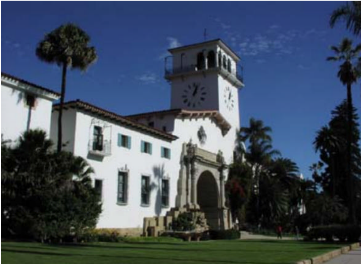
The Santa Barbara Courthouse, an architectural masterpiece moments from the CCME Symposium, 2-5 February 2004