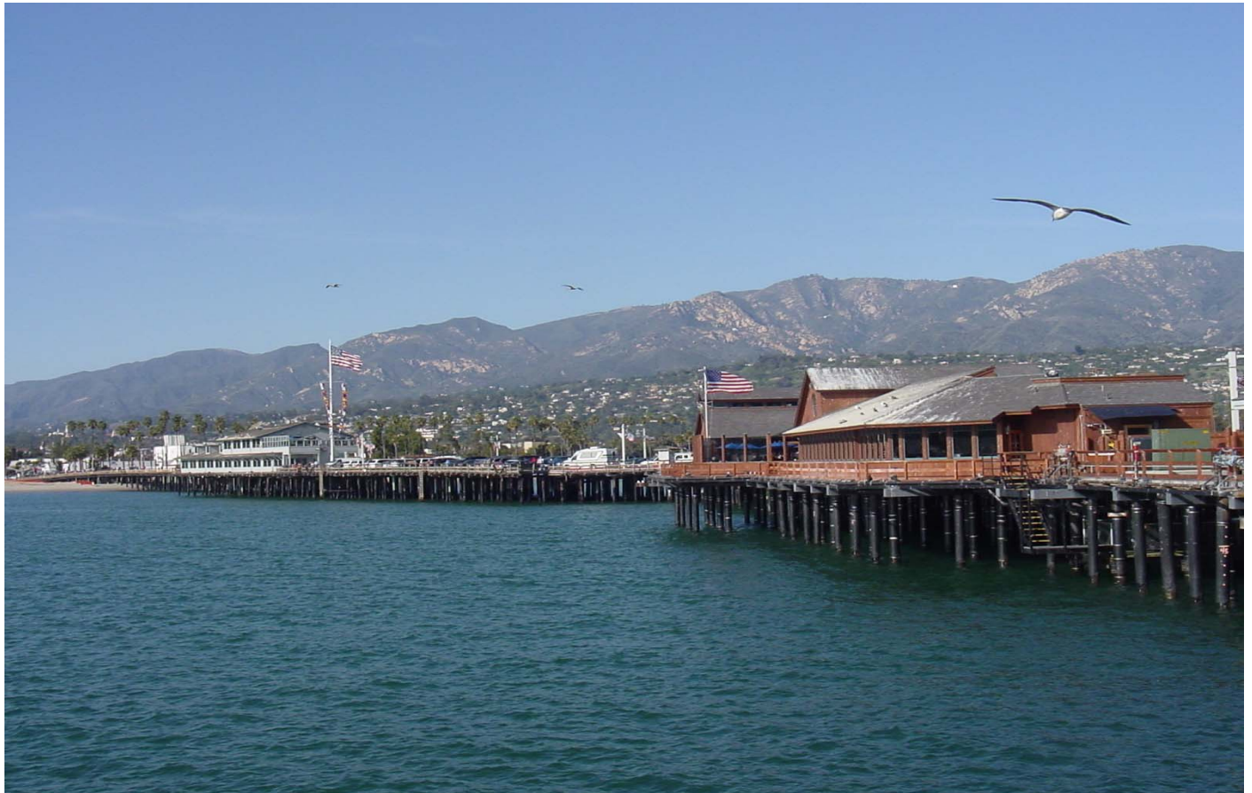
Santa Barbara's Stearns Wharf, in walking distance of the CCME Symposium, 2-5 February 2004